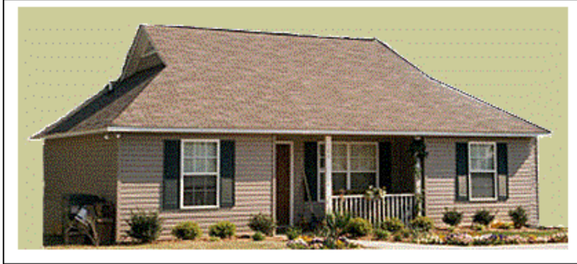
DUTCH HIP ROOF